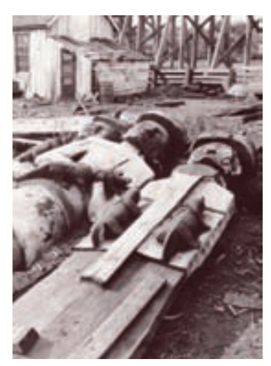
CARVED HOUSE POSTS ON THE OLD SONGHEES RESERVE