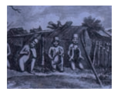
INDIAN BURIAL GROUND NEAR VICTORIA

Project partners include: the Esquimalt and Songhees Nations, the City of Victoria, Government of Canada, Department of Canadian Heritage, Cultural Capitals of Canada Program, the Province of British Columbia, the Provincial Capital Commission, the Greater Victoria Harbour Authority, and the Union of British Columbia Municipalities.